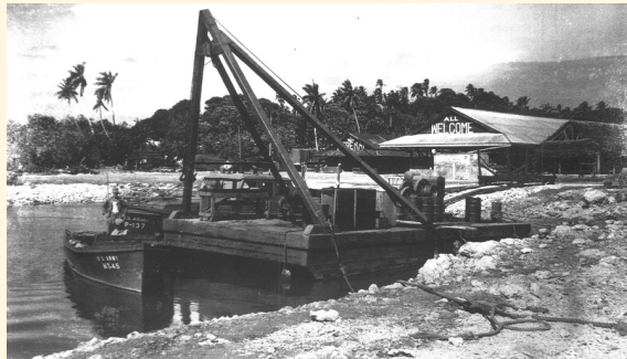
Port and marine railway at Arutanga.