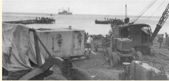
The "Ludington" anchored outside the reef while the causeway is extended and equipment landed.

The first ship delivering supplies was USAT "Ludington", which also brought four mine yawls and three 25-ton barges, that were used for unloading once the channel was deepened.